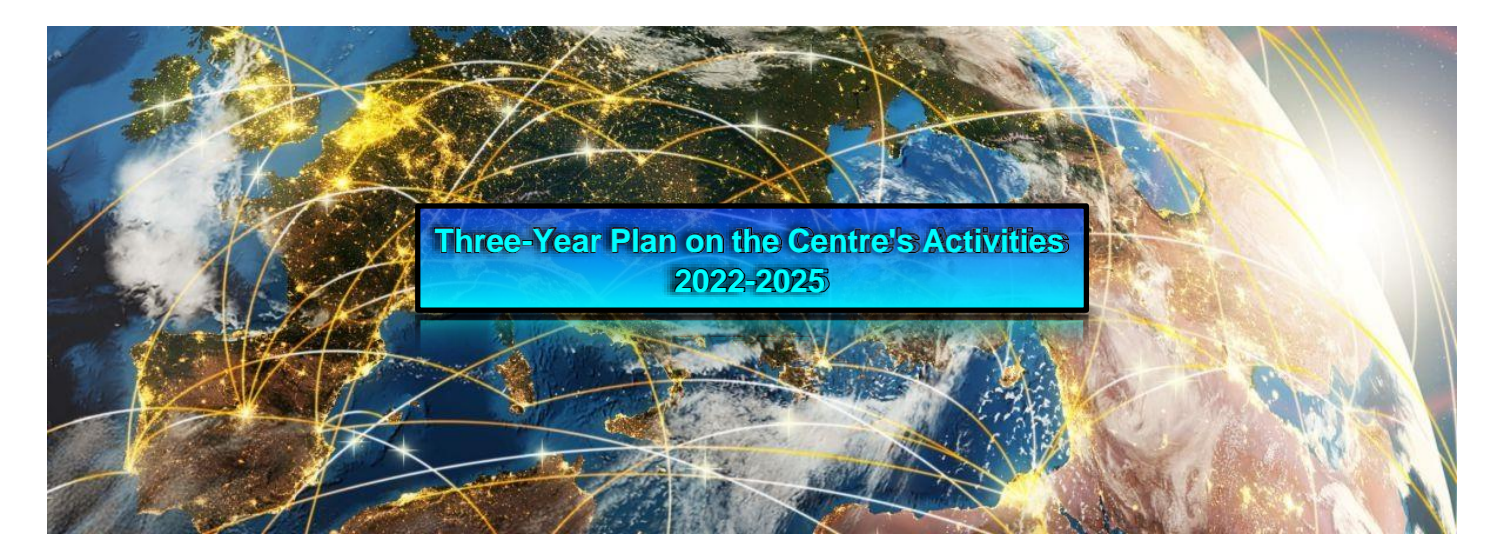
To the attention of the Scientific Council of the Centre for Advanced Studies 'A.S.Cent