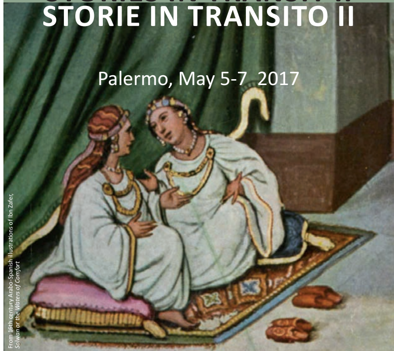
From 14th century Andho-Spanish illustrations of Ibn Zafar, Sowman or the Waters of Comfort